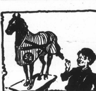
5-A BIAS GIRTH Horse Blankets Will keep their position on the horse. Can't slip or slide. Tight girthing unnecessary.

Blanket your horse in the stable and use a 5A Bias Girth. 5A Blankets are made for strength and wear, and will outlast others.