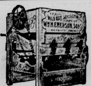
6 SHOE POWER SEPARATOR 3 SHOE HAND SEPARATOR 1 SHOE ELEVATOR WHEAT