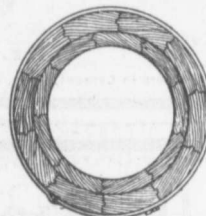
End view of Pipe and Coupling

Please mention the CANADIAN CONTRACT RECORD when corresponding with advertisers.