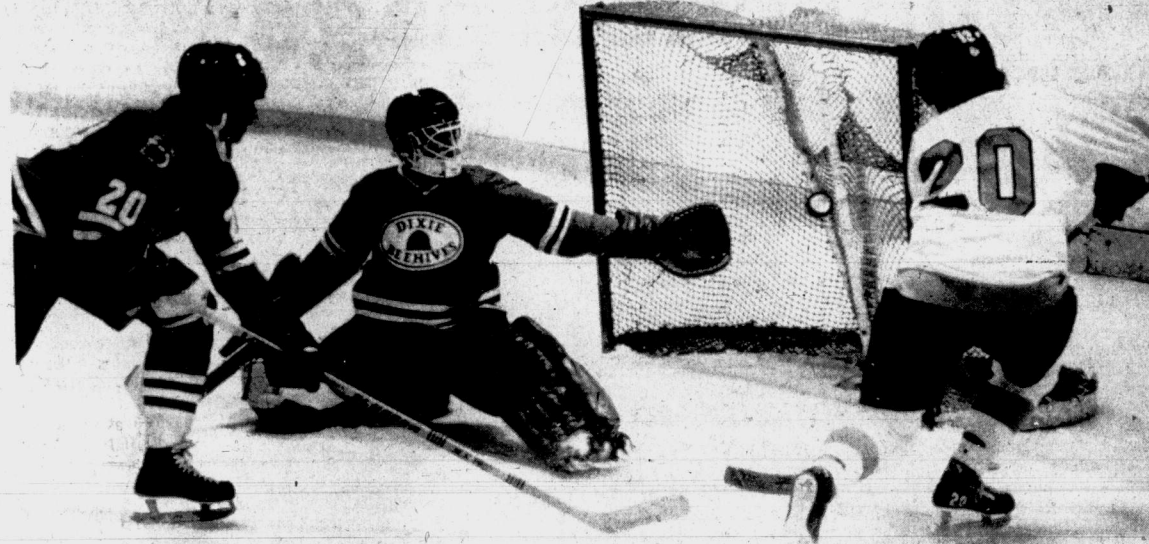
How did he miss?