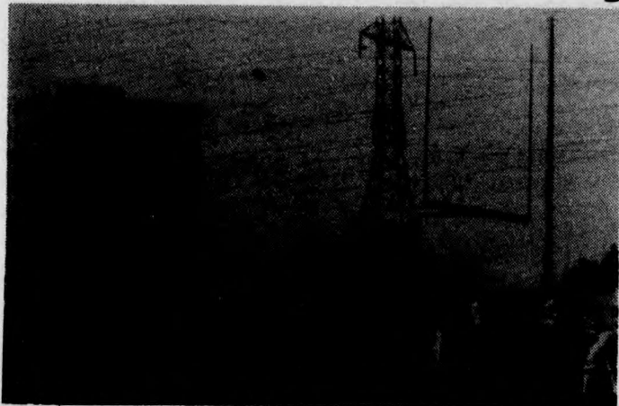
MUDDY FIELD, Forced converts kicked from end zone.