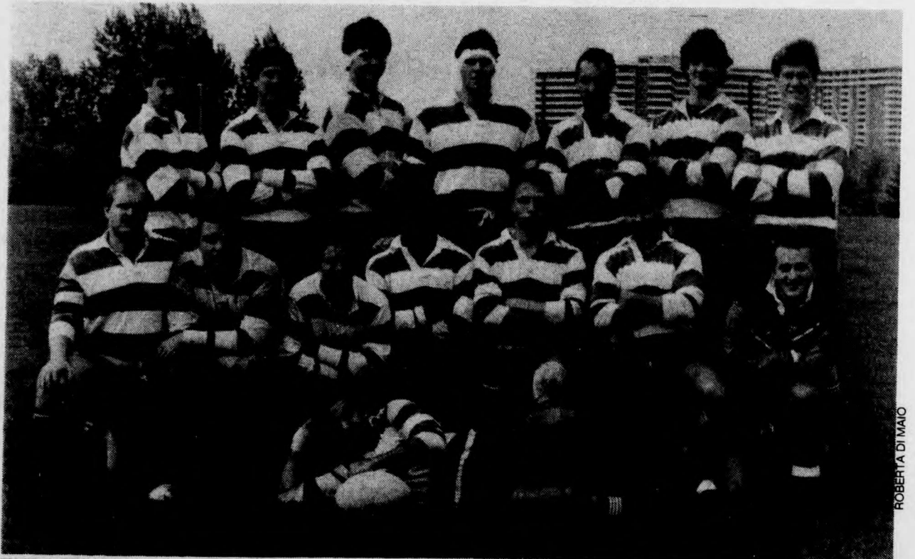
THE A-TEAM: York's rugby team wiped out Trent 46-6 to run their consecutive win streak to 17-0. They are only one win away from their second undefeated season.

A victory Saturday would give York its second straight undefeated season.