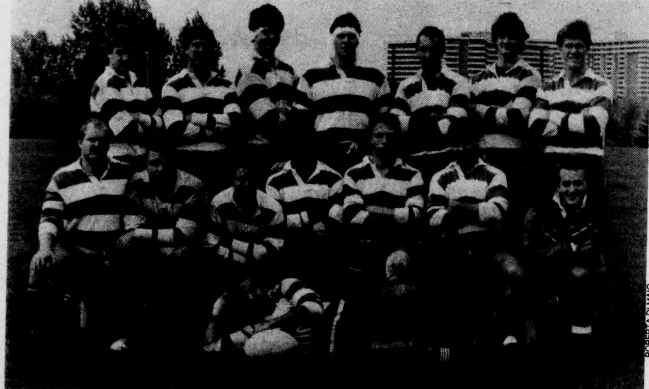
THE A-TEAM: York's rugby team wiped out Trent 46-6 to run their consecutive win streak to 17-0. They are only one win away from their second undefeated season.

A victory Saturday would give York its second straight undefeated