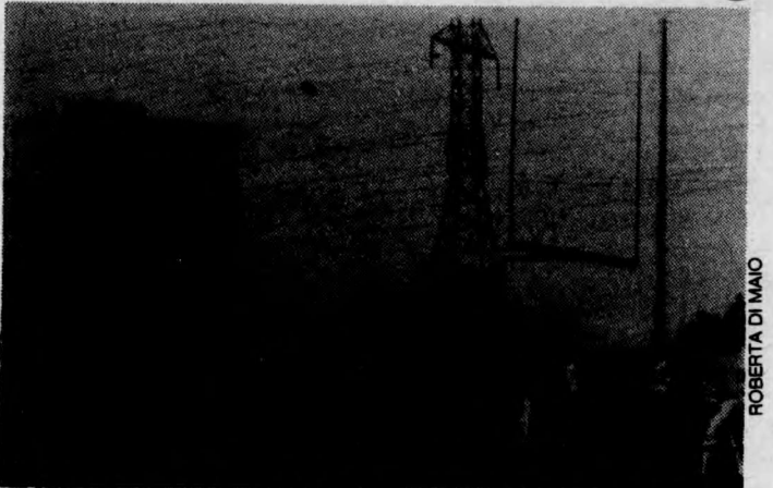
MUDDY FIELD, Forced converts kicked from end zone.