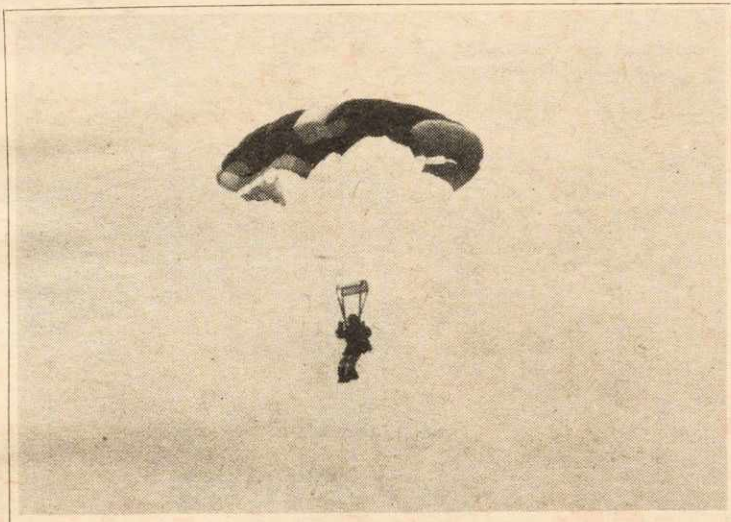
Dal jumpers win 1st place Senior Freefall Acrobatics

Labour Day found some of our members off in Pennsyl-