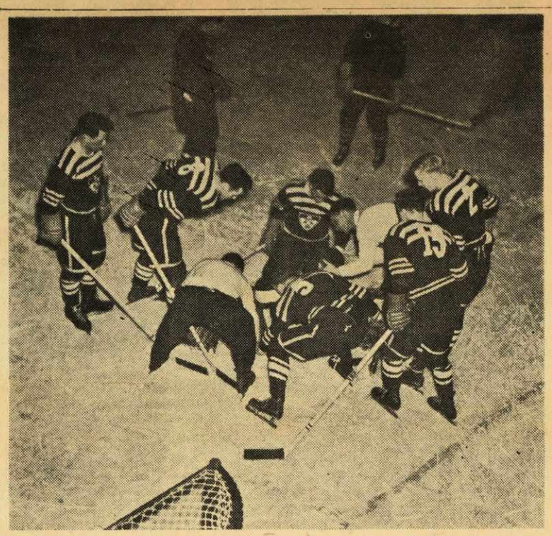
SPEAK TO ME seems to be what the group of St. Mary's players are saying as they bend over their unconscious team-mate. Note the concern of officials and St. Mary's players over the fallen player and the utter lack of interest shown by the two unidentified Dalhousians. After utter lack of interest shown by the two different Dal 7-4. the interruption St. Mary's went on to defeat Dal 7-4.