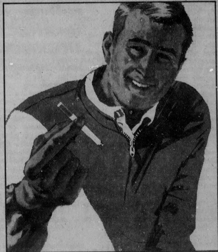
The Player's Jacket—fashioned by BAN(LAMAC in Terylene, a Cel-Cel fibre. *Reg'd. Con. T.M.

Come on over to smoothness with no letdown in taste