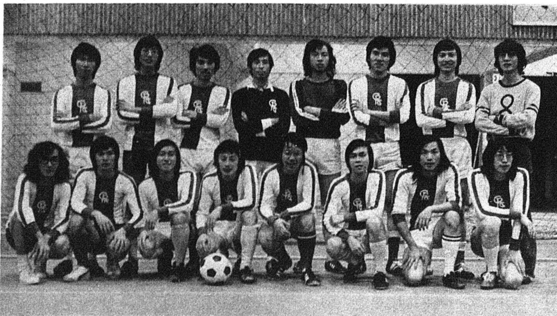
Chinese Students' Association, intramural indoor soccer champions.