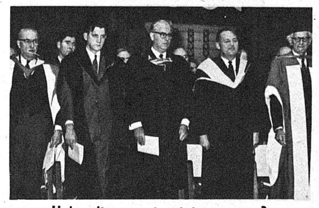
University promotes status quo . . . ?

Although the access to post-secondary education is not universal, and hence the benefits are not shared equally; through government subsidization, everyone is forced to share the expense. University financing is thus clearly an example of the subsidization of the rich by the poor.