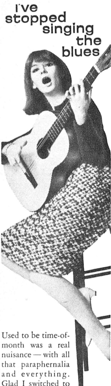
I've stopped singing the blues

Several resolutions will be debated to show delegates how the real UN operates.