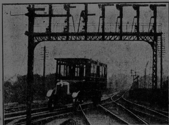
A RAIL MOTOR BUS

The North Eastern Railway in England runs a motor bus on rails where it would not pay to run a regular train. This idea may be enlarged upon.