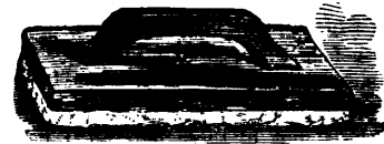
FLAT BLACKBOARD BRUSH.