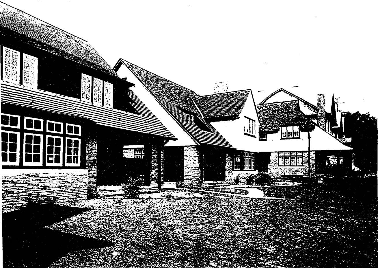
GROUP DEVELOPMENT, LYNDBURST AVENUE, TORONTO. HAROLD R. WATSON, ARCHITECT.

ceedingly monotonous type of architecture adjacent to the site. The south house, which is illustrated by plan, is just being completed, and its irregular contour was necessary through the slope of the adjacent street.