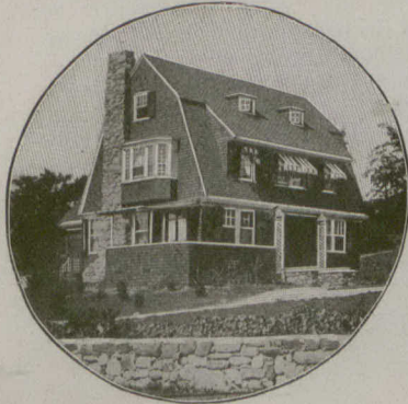
Clark & Russell, Architects, Boston, Mass.

The Original and Standard Shingle-stains. Used and proved in every climate for over twenty years. Every gallon guaranteed.