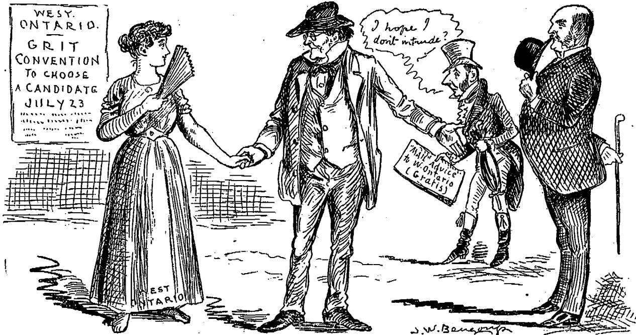
THE WEST ONTARIO MATCH-MAKING.

Farmer Blake. —I WOULD NOT COERCE YOU, MY DAUGHTER, BUT IF YOU LOVE YOUR FATHER YOU'LL TAKE THIS NICE YOUNG CITY MAN.