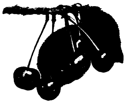
FIG. 1859. EMPRESS EUGENIE (REDUCED.) easily distinguished. Both bear in thick clusters all along the branches, and their mild acid makes them more desirable for pies than the Kentish varieties, at least to the taste of many people. They have one fault,