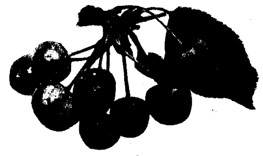
FIG. 1861. BEARING HABIT OF CLEVELAND.

viz., that of uneven ripening, often showing very green samples and very ripe ones on the same bunch. The Duke cherries may