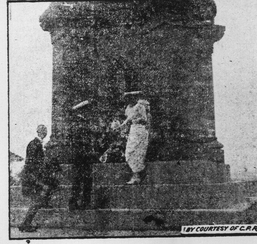
The Prince Deposits Wreath at Monument des Braves at Quebec

less, and the beautiful results will strength—try Scott's. Minard's Liniment Cures Garget in