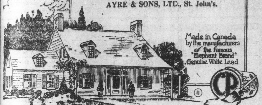
Made in Canada by the manufacturers of the famous “Elephant Brand” Genuine White Lead