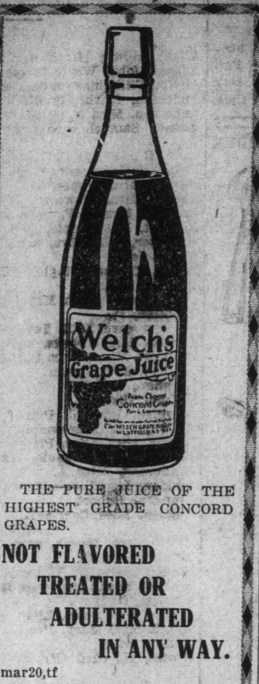
THE PURE JUICE OF THE HIGHEST GRADE CONCORD GRAPES.

GARLAND'S Bookstores 177-9 Water Street.