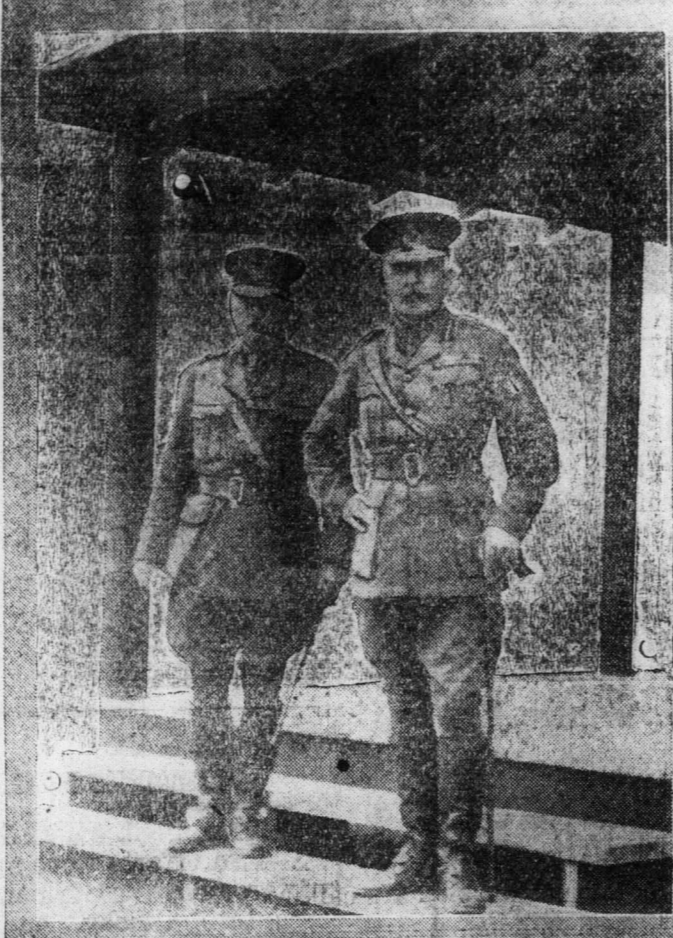
The Duke of Connaught photographed on a recent visit to Camp Borden. He is shown standing with General Logie, on the steps of the latter's bungalow.