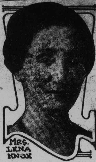
Tanlac Vegetable Pills For Constipation. Made and Recommended by the Manufacturers of Tanlac.