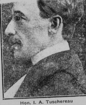
Hon. I. A. Tuschereau

Canada's fisheries have doubled in Prime Minister of Quebec.