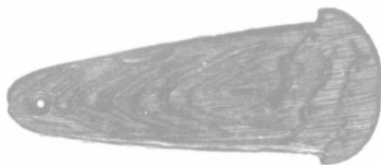
FIG. 102. (Quarter Size).

This gorget or amulet of Huronian slate, from the Tweeddale collection is one of the finest in the museum. It is four and five-eighth inches long and handsomely veined. What may be called the lower side is not so well finished as the other. Unlike many objects of this class the hole shows signs of wear, the upper side of it being perceptibly the smoother. The flanges at the lower end are peculiar to this specimen. It was found in the township of South Yarmouth, county of Elgin.