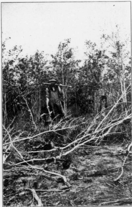
This picture shows the second growth that grew up on section three. It cost $17.36 to remove this, in addition to what it cost to clear the land of stumps. Settlers should avoid this extra cost, if possible.