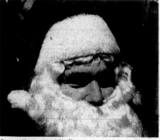
Santa Claus of the North Pole: "I'll be back at the North Pole. All the elves and I will get together for a little party and dinner and we'll begin to plan next year's toys. I wish everyone a Happy New Year!"