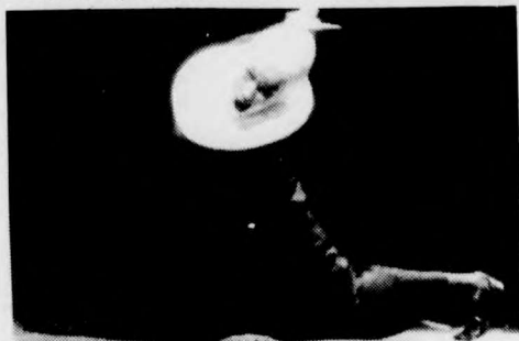
Agnes of God (above) plays Bathurst Street Theatre. 533-1161.

□ Rom Theatre's tribute to Billy Wilder continues with a screening of the 1944 classic Double Indemnity . The screenplay was adapted by Wilder and Raymond Chandler from a story by James M. Cain. ROM Theatre 2:30 pm. Admission $3 (students $2).