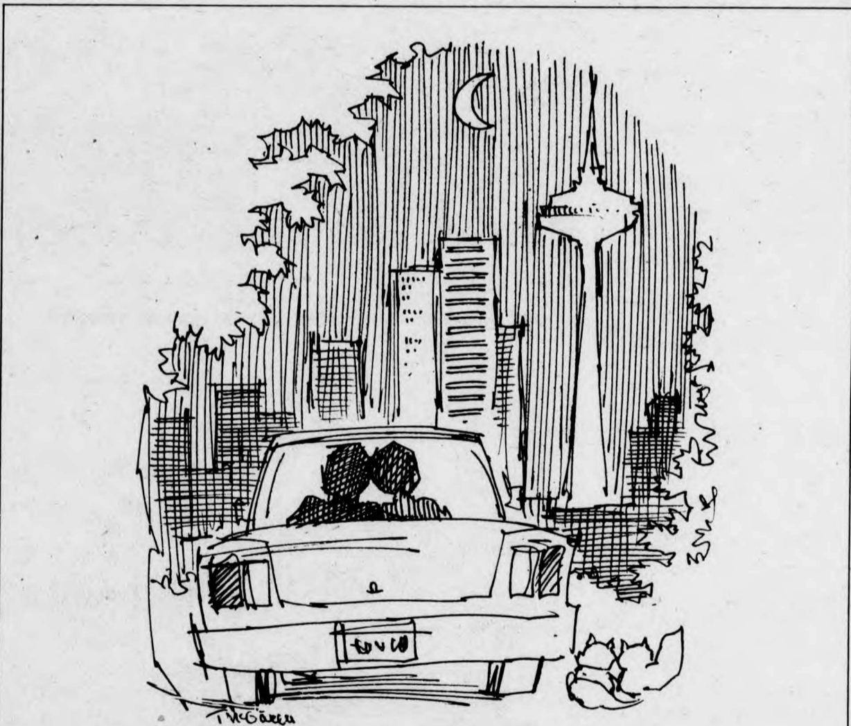
"Love is Beautiful"

It may seem hard to believe, but finally the secretaries of this university are going to get what's been coming to them. Theatre Passe Muraille will put on a play based on their experiences as part of the Stong Working Women Symposium: Finger Pinkie a feminist play, can be seen in the Calumet common room next Tuesday at noon.