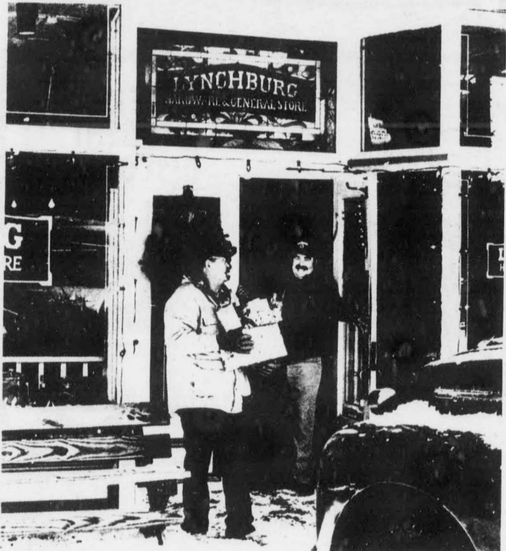
If you'd like a booklet about Jack Daniel's Whiskey, write us here in Lynchburg, Tennessee 37352, U.S.A.

So if you like any bands listed above then you'll love the performance that "See Spot Run" has to dish out.