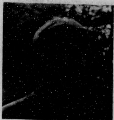
Terry Wright Civil V "Not a hell of a lot."

Question: What do you do to support the Red Devils?