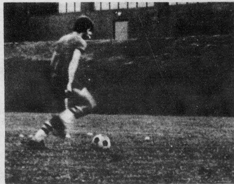
Over 400 people are involved in intramural soccer this year.