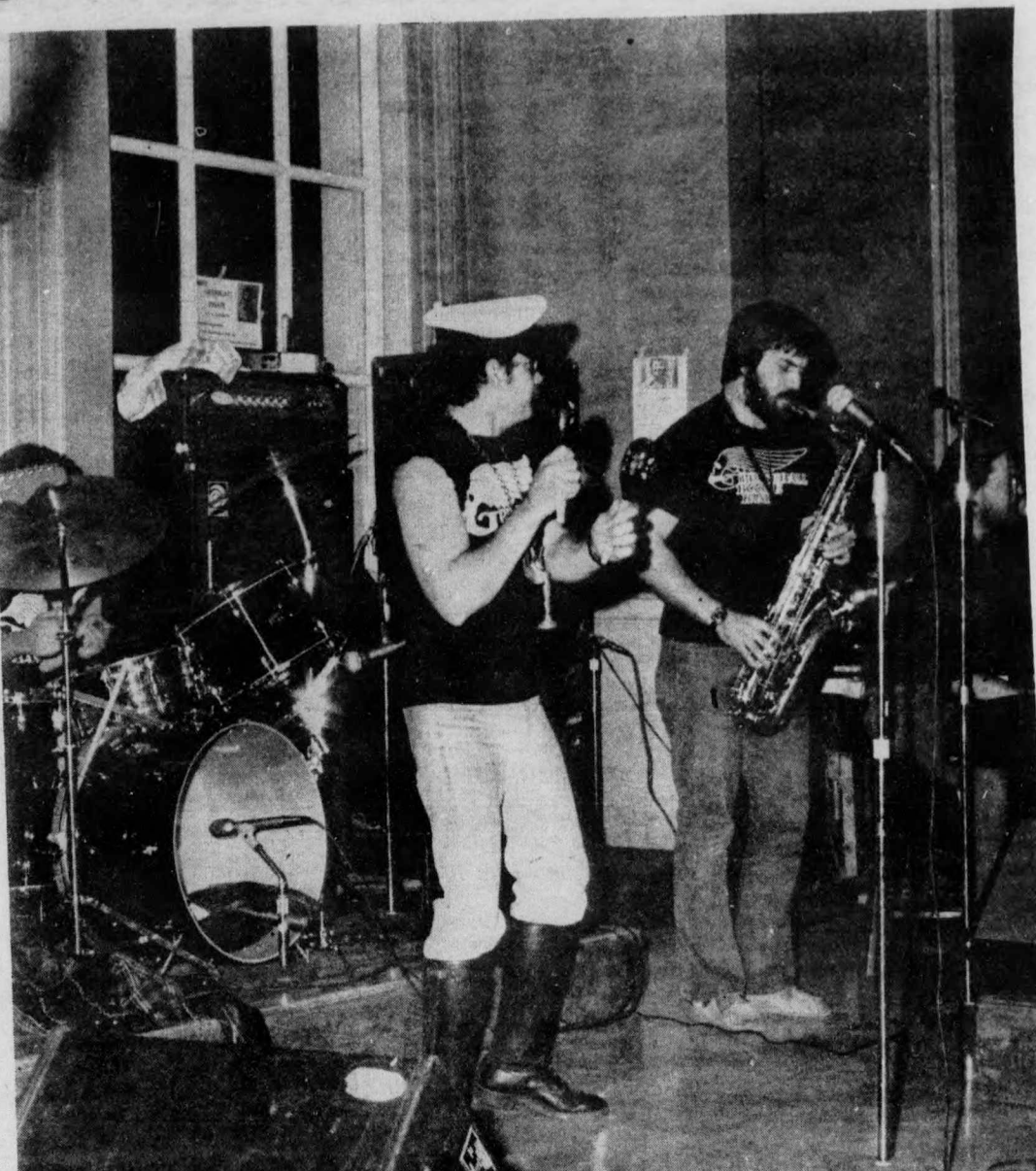
The Greaseball Boogie Band goes to it at Wednesday night's pub. This may be our last pub, so I hope you attended it.

Commenting on the possibility of SUB expansion, he said he hoped a provision will be made for space to seat 800-1000 people. The room could be used for pubs at which the SUB could break even.