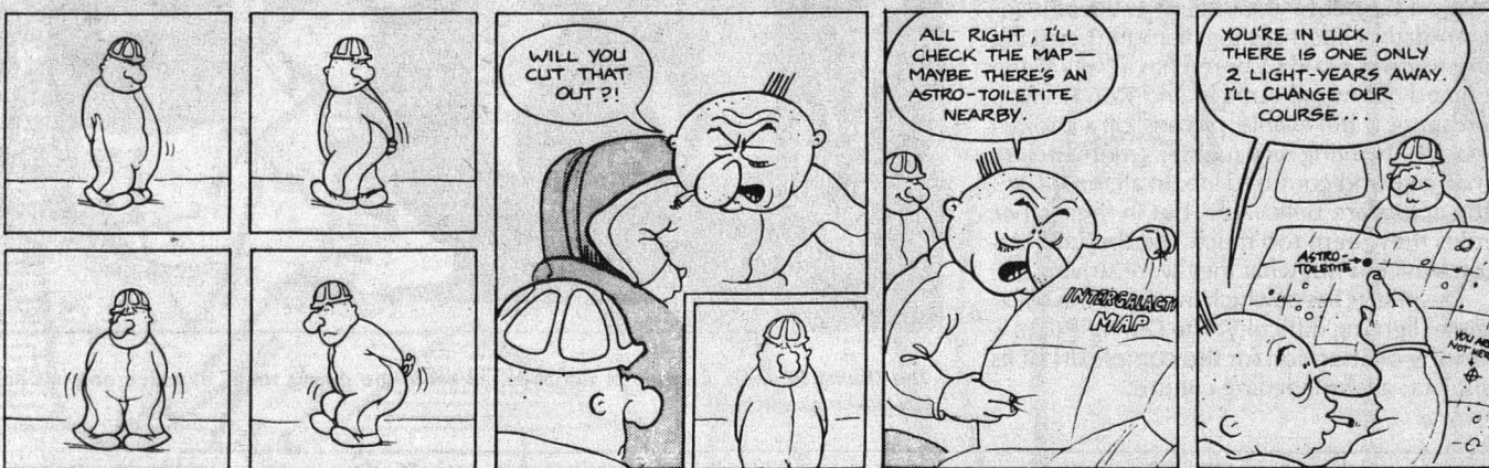
Bub Slugs from Gateways gone by.