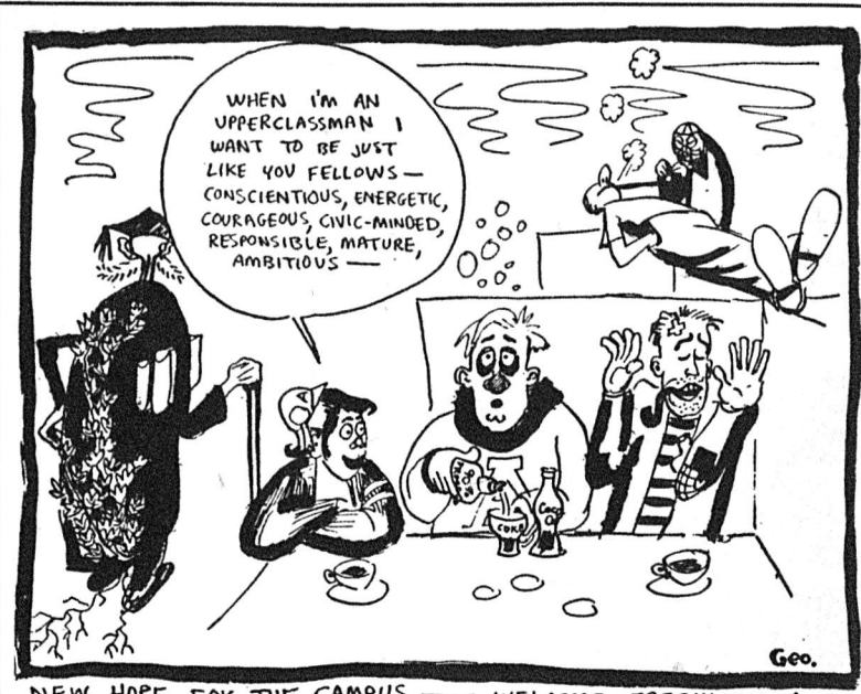
FOR THE CAMPUS WELCOME, FRESHMEN !

We'll just have to laugh off the Bears' 28-0 football loss to Whitworth College. The Bears, one must remember, are just Canadian boyswhile the Whitworth Pirates are all sureenough Yankees. Why even the Edmonton Eskimos are allowed 11 imports a game.