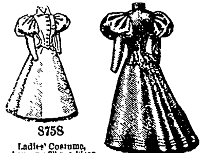
Ladies' Costume, having a Three-Piece Skirt (To be Made with a Flaring Collar or a Plain Standing Collar): 13 sizes. Bust meas., 28 to 46 inches. Any size, 1s. 8d. or 40 cents.

One short puff of the breath through the Blower supplied with each bottle of Dr. Agnew's Catarrhal Powder diffuses this powder over the surface of the nasal pas- sages. Painless and delightful to use, it relieves instantly and permanently cures Catarrh, Hay Fever, Colds, Headache, Sore Throat, Tonsillitis and Deafness. All druggists.