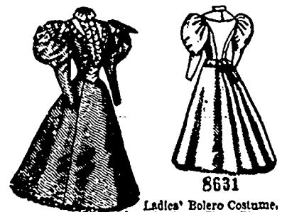
Ladies' Bolero Costume, having a Three-Piece Skirt Gathered at the Back (To be Made With or Without the Peplum and Epaulettes): 13 sizes. Bust measures, 28 to 46 inches. Any size, 1s. 8d. or 40 cents.