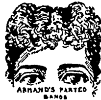
Handsome Parted Bang, $2.50, $5 and $7.50.

Quickest, easiest, cheapest and best single preparation in the market. Price, $1.25. Superfluous hair safely removed and destroyed with CAVILLERINE. $2.00 by post.