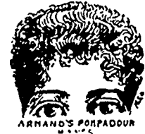
Beautiful style of Bang, $5 and $7.