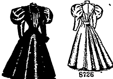
Ladies' Costume, with Five-Gored Skirt Gathered at the Back: 13 sizes. Bust measures, 28 to 46 inches. Any size, 1s. 8d. or 40 cents.