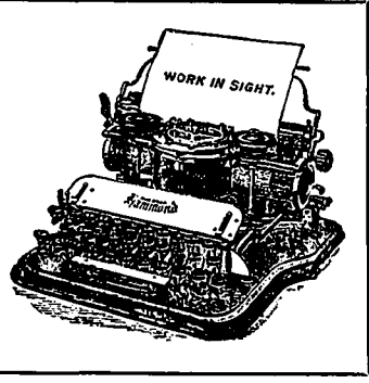
IT IS THE BEST

Because it does the GREATEST VARIETY of the BEST TYPEWRITING for the LONGEST TIME with the LEAST EFFORT.