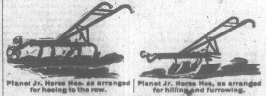
Planet Jr. Horse Hoe, as arranged for hoeing to the row. Planet Jr. Horse Hoe, as arranged for hilling and furrowing.

A Valuable Descriptive Catalogue will be mailed free of charge on application to,