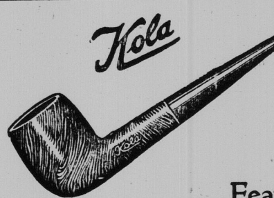
An old friend from the start