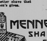
MENNEN'S SHAVING CREAM