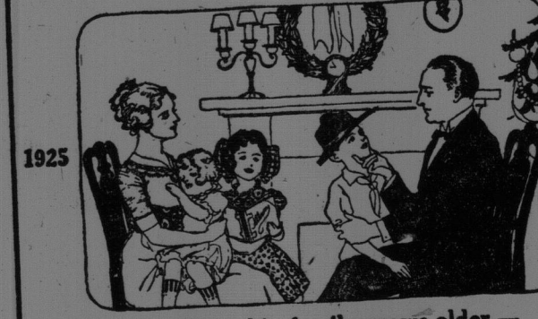
—will, as his family grows older,—