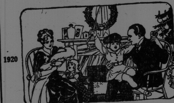
The type of man who protects his home—

Your future Christmas Days as they may be.