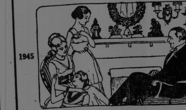
—which grows with the years—