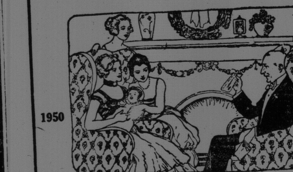
—and fortifies his old age with a substantial income.

You know that the biggest thing you can do for your family this Christmas is to make sure that never in the future will good cheer and comfort be lacking. To provide for them "come what may"—Why not do it?