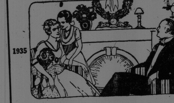
—find increasing prosperity—