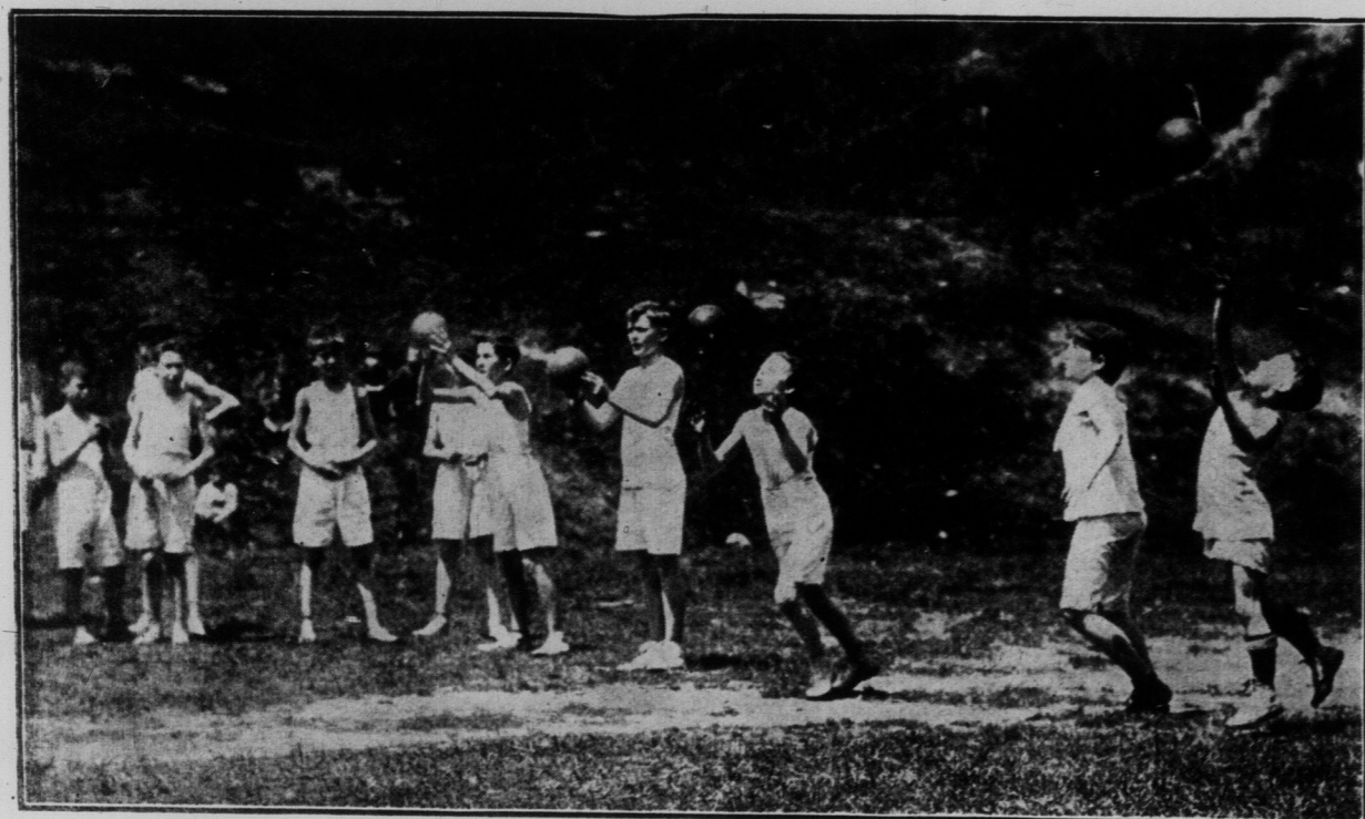
AN EXCITING GAME PLAYED BY THE JUNIOR MEMBERS OF THE Y.M.C.A. IN THE SHAW STREET GULLY—PUFF BALL. IT MAY SOUND A SIMPLE MATTER TO BLOW THE BALLOON STRAIGHT AHEAD, BUT IT'S VIGOROUS, DIFFICULT WORK.

NEXT WEEK—THE CHARMING IRISH IDYLL "LOVE'S YOUNG DREAM" HOLIDAY MATINEE MONDAY, MAY 25—NEXT WEEK