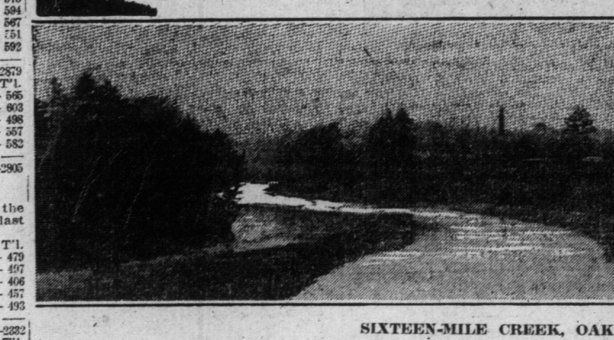
SIXTEEN-MILE CREEK, OAKVILLE, OPPOSITE TUXEDO PARK.

On Lake Ontario, twenty-one miles from Toronto, fifteen miles from Hamilton. An ideal all-the-year-round residential town. All conveniences except gas. Splendid electric light service, good waterworks, well-equipped public and high schools, public library, churches, all-night telephone and excellent G.T.R. service. Commutation tickets—fare to Toronto 15 cents, students 6 cents. Reduced fare ten-trip tickets all the year round. Radial electric railway to Hamilton every hour. Boat service to Toronto and Hamilton promised at an early date. It is expected the Canadian Northern and Canadian Pacific Railways will be completed between Toronto and Hamilton, through Oakville, within a very short time, when railway communication will be still better.