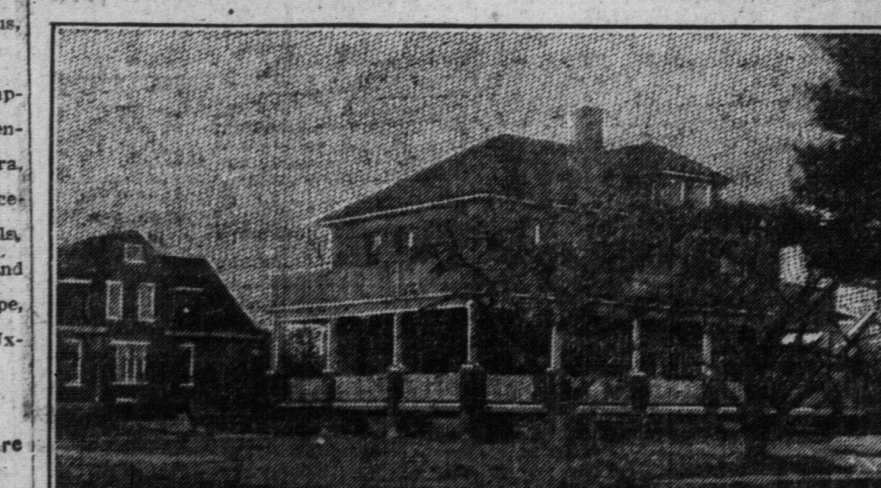
RESIDENCE AT TUXEDO PARK

The town will install a new fire-alarm system and the Government has appropriated $10,000.00 for dredging the harbor to make it capable of handling the large Lake Steamers.