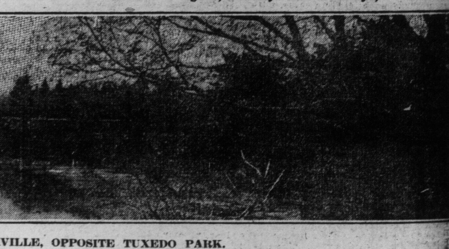
SIXTEEN-MILE CREEK, OAKVILLE, OPPOSITE TUXEDO PARK.

Phone 6510 Main. Nights, Sundays and Holidays, Park 3070.