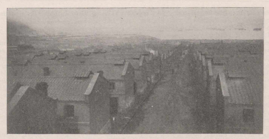
Fig. 5 indicates type of dwelling houses provided by the company for its Chinese coolie labor