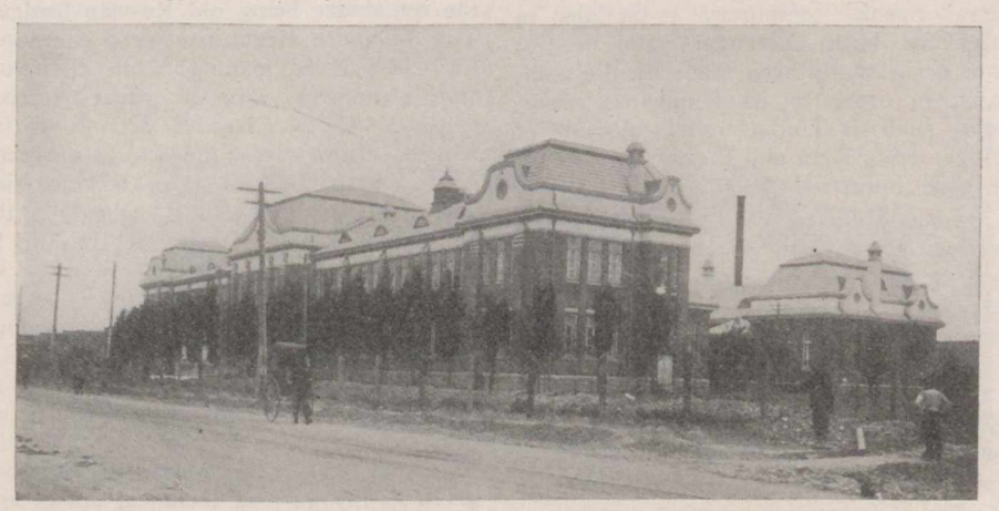
Fig. 6 illustrates a research laboratory at Dairen for Manchurian products