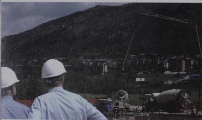
The new student centre at L'Aquila University

It was a gesture of support for the Abruzzo region of Italy, which had been devastated by a major earthquake three months earlier that killed 297 people and left 65,000 homeless. Standing amid ruins in the historic town of L'Aquila at the G-8 Summit in July 2009, Prime Minister Stephen Harper pledged that Canada would construct a new student centre at L'Aquila University, where 13 students had died.