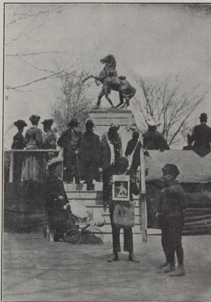
At the foot of the South African Monument, Dominion Square, Montreal.