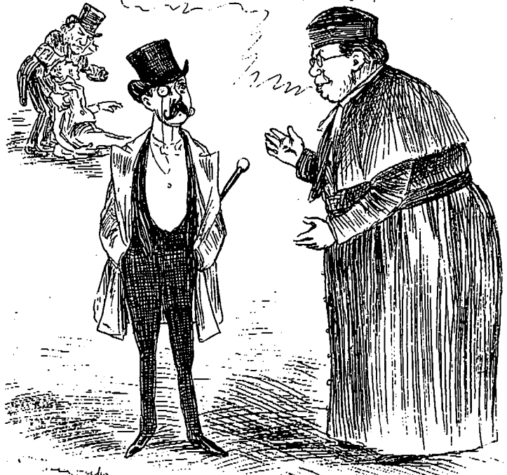
THE ARCHBISHOP'S APPEAL TO LORD RANDY CHURCHILL.

You're a nice, smart young fellow, Lord Randolph... why not join the grand old man, and help him to cure the ills of poor Ireland?