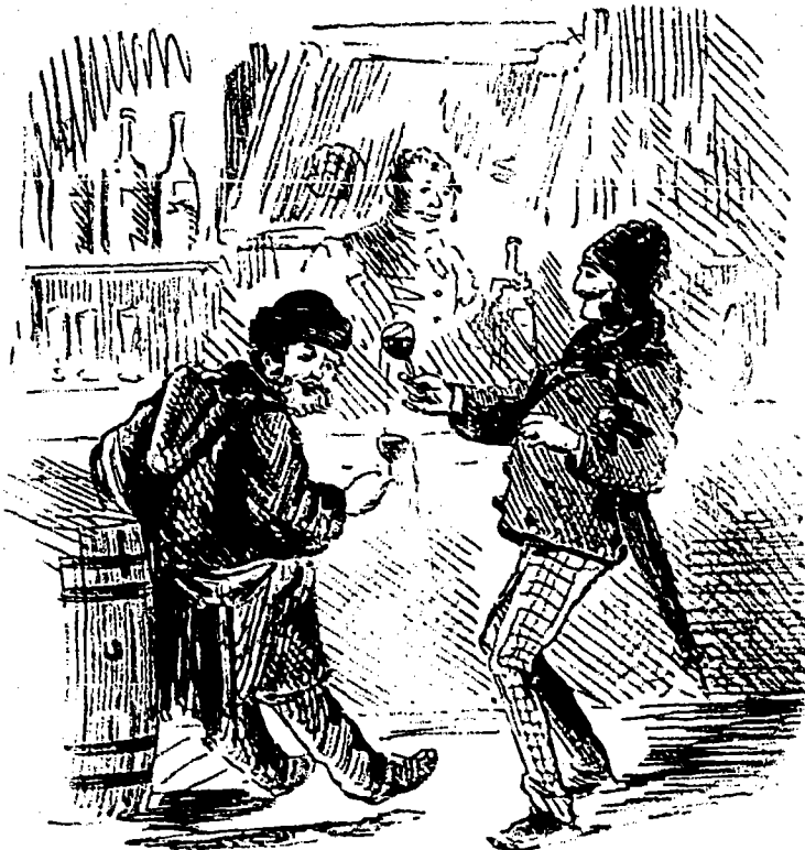
Congratulate each other on having found the very thing they were looking for.