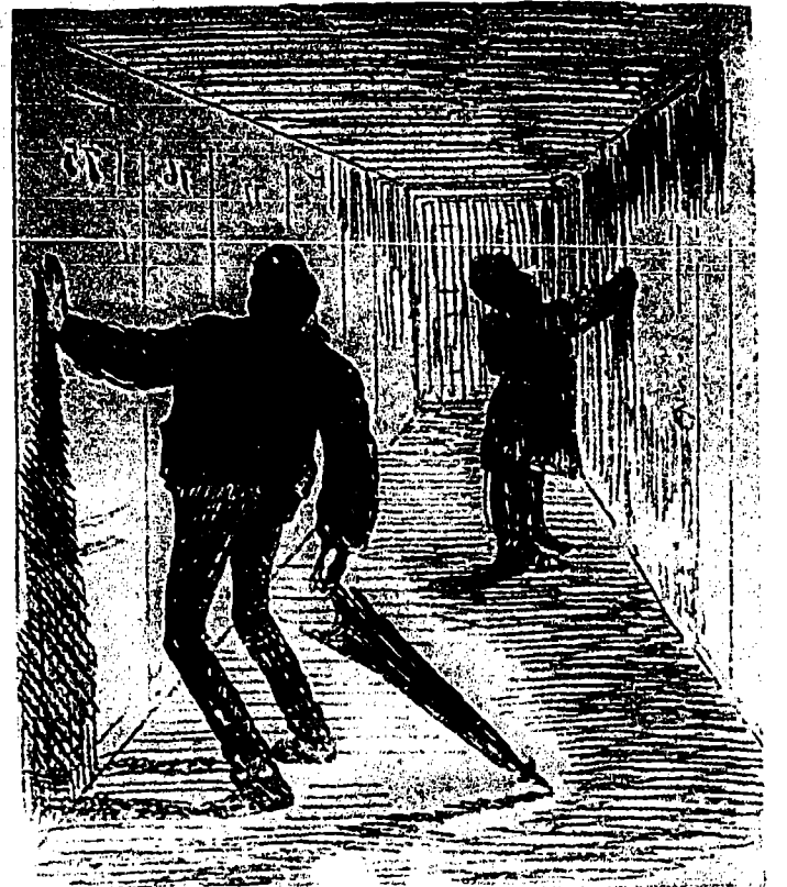
The numbers have somehow got mixed up.