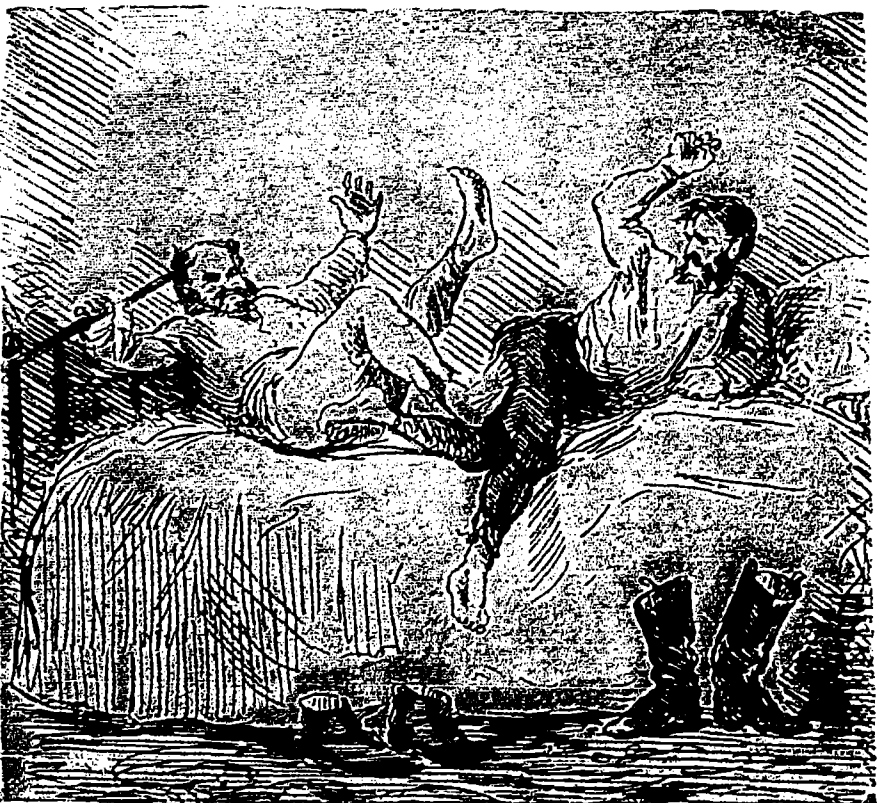
They make the startling discovery that each has a companion, and agree to kick him out.

CLUBS: Every Club of Five subscribers sending a remittance of $20, will be entitled to Six Copies for one year, mailed to one address. Montreal subscribers will be served by Carriers. Remittances by Post-Office Order or Registered Letter at the risk of the Publisher. Advertisements received, to a limited number, at 15 cents per line, payable in advance.