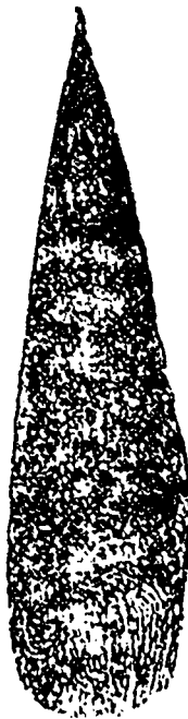
NATURAL WAVY SWITCHES.

When ordering by mail send samples of hair and Post Office Order or Ex- press Order, and goods will be sent by return mail.