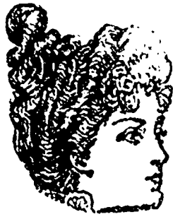
HYGIENIC HEAD COVERING.