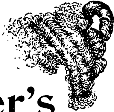
NATURAL WAVY WIG