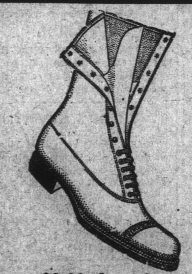
$9.00 the pair.