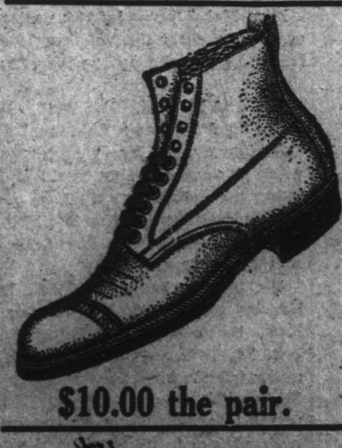
$10.00 the pair.