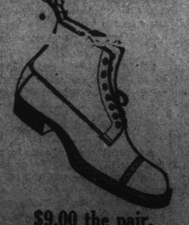
$9.00 the pair.