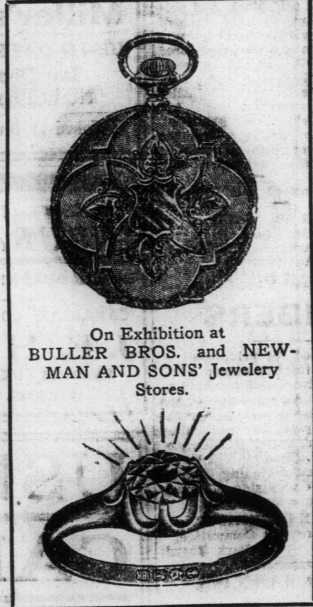
On Exhibition at BULLER BROS. and NEWMAN AND SONS' Jewelry Stores.

Several of the candidates are over confident. This is a big contest and is going to take many times as many votes as some think. The candidates who think they are in the land of plenty of votes are going to lose—Why? Because the real live, energetic candidates are getting the results. Wake up—it is results this week or lose. Get busy.